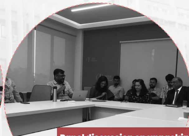
Panel discussion on unpacking the Electricity (Amendment) Bill, 2022 at Center for Policy Research