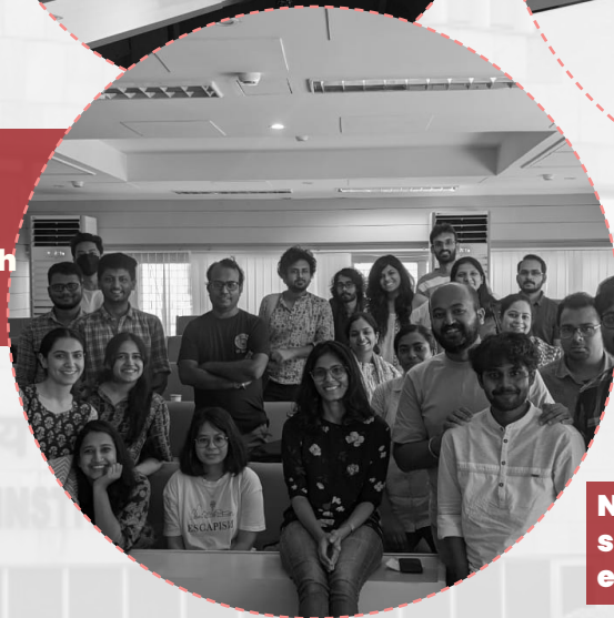
Networking sessions with the entire school